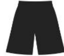
PRIMARY PLAIN SHORTS From £5.75