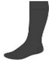
KNEE HIGH SOCKS X 2 PAIRS From £6.99