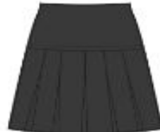
FAN PLEAT SKIRT From £13.99