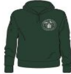
KETTLESHULME HOODIE (YEAR 6 ONLY) From £16.50