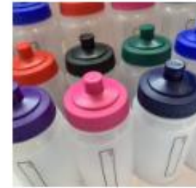
WATER BOTTLE TRANSLUCENT From £3.75