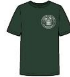
KETTLESHULME DAY/PE T-SHIRT From £7.00