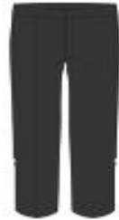
STURDY JUNIOR TROUSER - BLACK/GREY/NAVY From £12.99