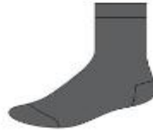
5X ANKLE SOCKS From £6.99