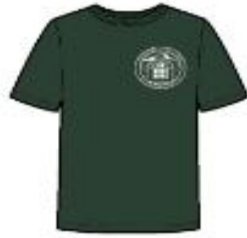
KETTLESHULME DAY/PE T-SHIRT From £7.00