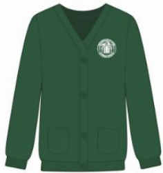
KETTLESHULME SWEAT CARDI From £16.50