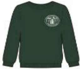
KETTLESHULME SWEATSHIRT (RECEPTION - YR5) From £14.50